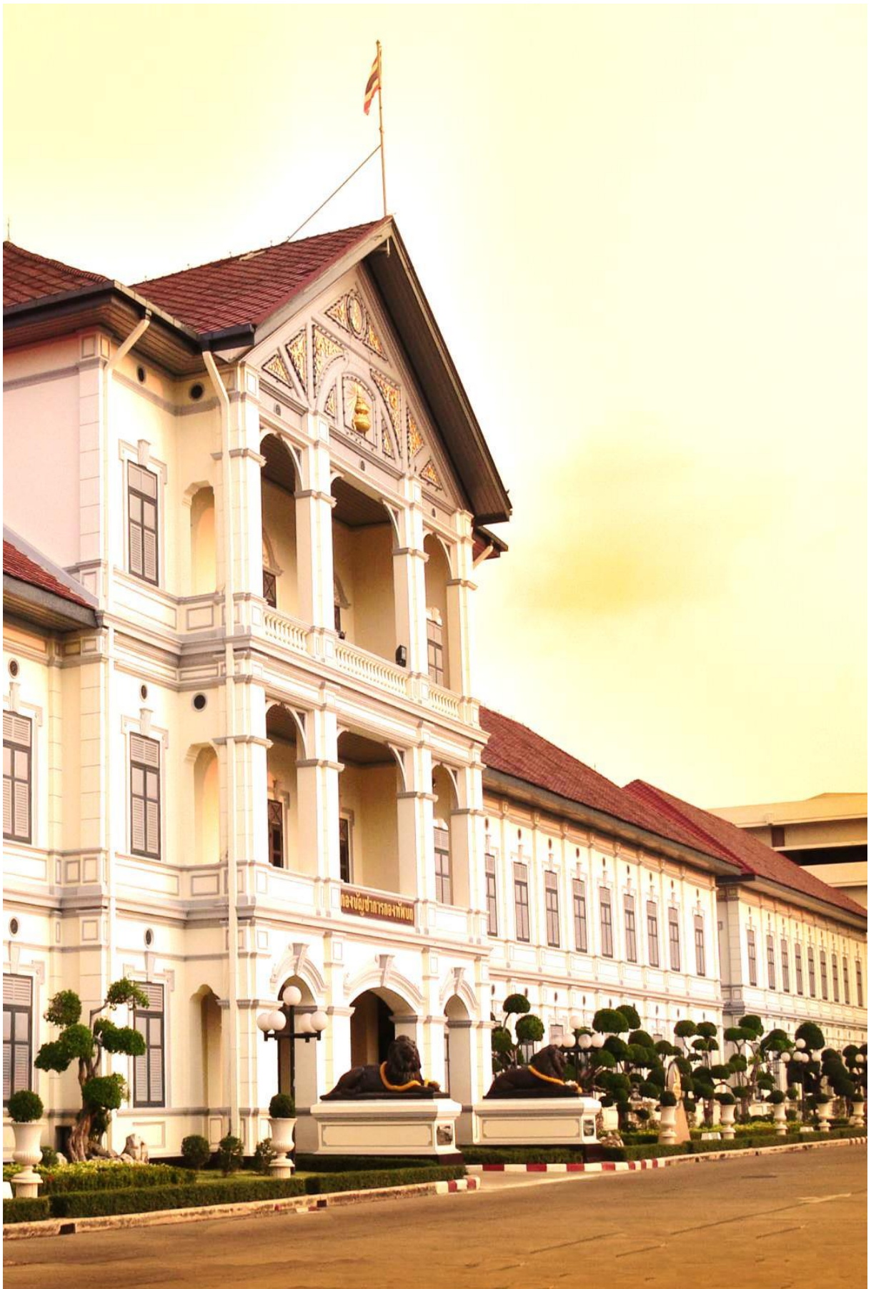
The Royal Thai Army Museum in Honor of His Majesty the King